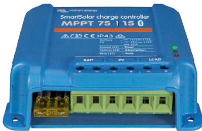
SmartSolar Charge Controller MPPT 75/15