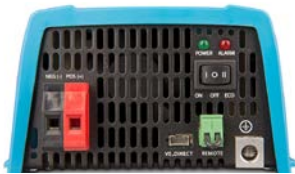
Phoenix 12/375 VE.Direct