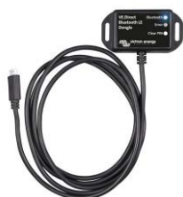
VE.Direct Bluetooth Smart dongle (must be ordered separately)

An excessively high or low battery voltage is indicated by an audible and visual alarm, and a relay for remote signalling.